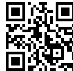
Office of International Affairs